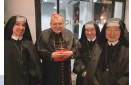
Above: The Sisters with Cardinal Burke.

The events of the weekend began with the recitation of the Rosary at the Cardinal's tomb with his family.