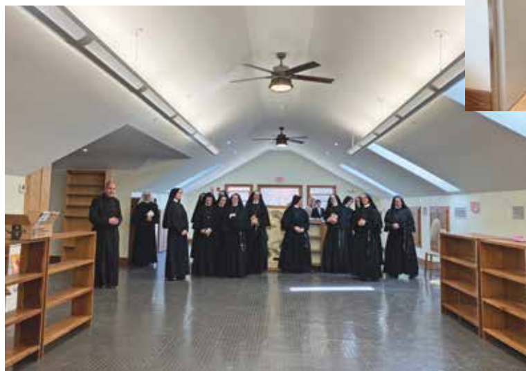
Above: Sisters take Saint Philomena (patroness of the project) on an elevator ride after we passed the inspection!

The progress leading up to the final inspection was exciting! On March 28, 2025, Religious and students watched as a 22-foot cupola was lifted to the top of the new addition. Despite the windy conditions, the 5,000-pound structure was easily hoisted by a 165-foot crane. We thank Astor Crane Services for generously performing this work free of charge. It was an