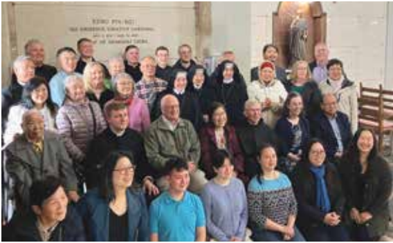
The group at the tomb of Cardinal Kung.

Afterwards, a small group gathered for dinner with Cardinal Burke and Archbishop Cordileone as the guests of honor. Archbishop Cordileone celebrated a Solemn High Mass the next day, and Cardinal Burke gave an inspiring sermon. It was a beautiful tribute to the Cardinal's life and legacy and the critical work of the Cardinal Kung Foundation.