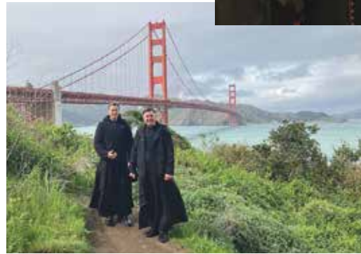
Left: The Brothers view the Golden Gate Bridge.