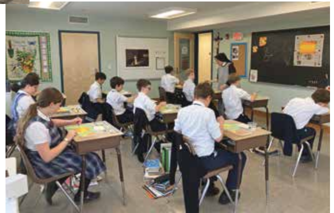
Making art in the sixth grade classroom.

Thank you for your continued support of this project. Every donation, big or small, directly supports Traditional Catholic Education! God will bless and reward you! Please continue to keep us in your prayers.