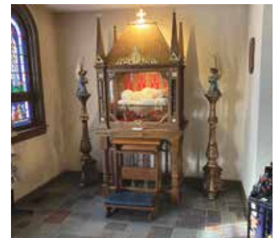
Above: Our beloved Maria Bambina shrine in its new location in the chapel vestibule is much more accessible.

Our shrine to Maria Bambina was moved to a more appropriate place in the chapel's foyer to accommodate the confessional. The Infant Mary is encased in an ornate wood-carved shrine with a kneeler in front. The Sisters look forward to showcasing this devotion on a new website within the next few months!