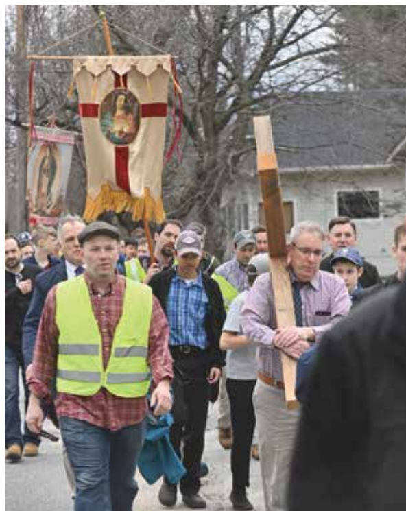
Members make a 7-mile Lenten Pilgrimage of prayer and reparation.