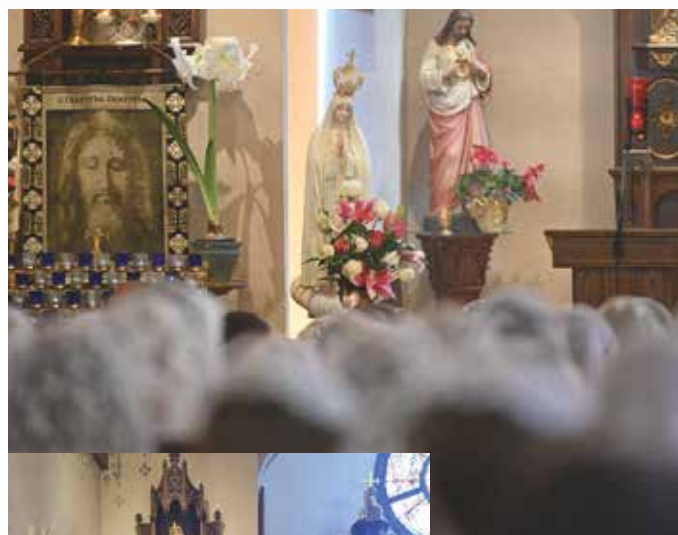
Above: Students pray the Rosary in front of the wood carved statue purchased in Fatima on the 100th Anniversary.

total consecration to Our Lady according to an age-appropriate version of "True Devotion" by Saint Louis de Montfort. This 5th grade tradition has been running for eight years, building up an army of young souls devoted to Mary.