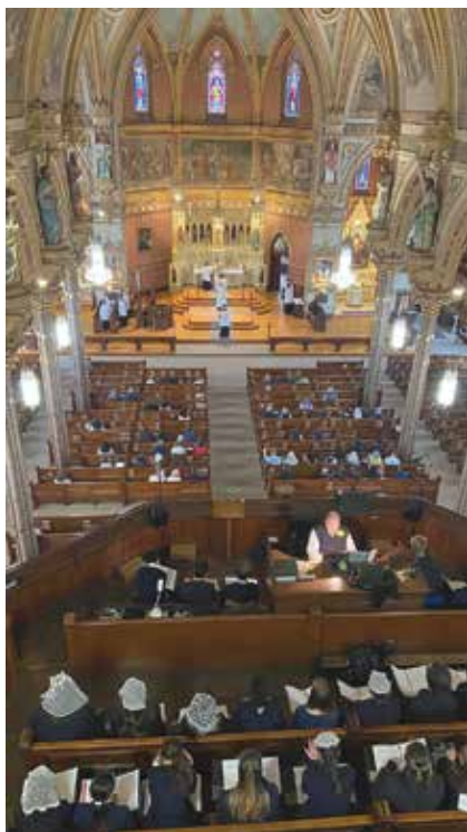
IHM Choir sings a Solemn High Mass at Saint John's Church.