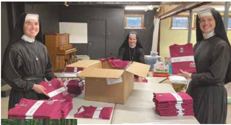
Above, Sisters package t-shirts for participating Leadership campers.

Sisters ship get ready to send off the boxes to Teen Week campers!