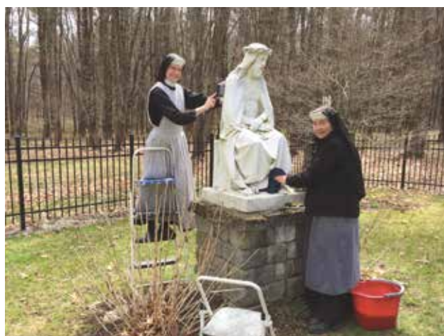
Just a few of the lovely garden shrines blooming around the monastery grounds!