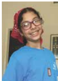
Left, photos of a few of the happy campers who recieved their boxes!